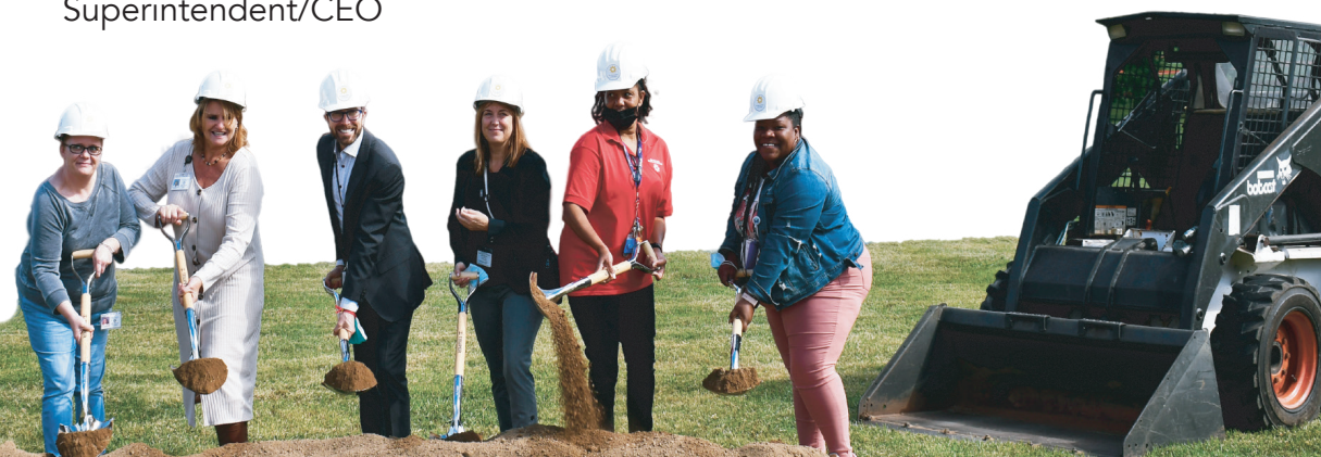
The Cottages on the Hill Groundbreaking with staff.

Check out our Staff section on page 3 to learn about our very own POSB winners.