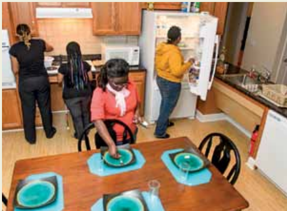
Our beautiful new Independent Living Home is now a reality. Built with public and private funds, it provides a unique opportunity for students to test drive important life skills before graduation.