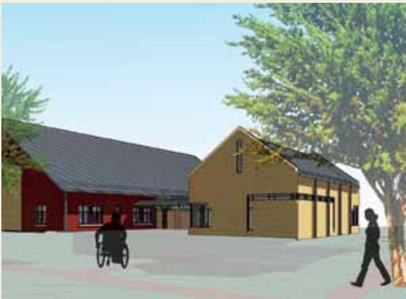
We finalized plans and secured funding for the state-of-the-art Learning Activity Center and Cottages . As the first phase of MSB’s School of the Future master plan, this facility will enable us to better meet the needs of students with multiple disabilities.

Our Heartfelt Thanks We are grateful to the many businesses, foundations, public agencies and private citizens who have helped us spread our wings over the past year. Thanks to your generous donations, MSB has made a real impact in the lives of the 1,300 students we serve throughout the State of Maryland. Here are just a few of our many accomplishments.