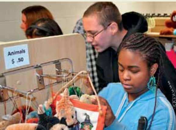
We celebrated the grand opening of the Hip Hop Shop , a thriving, student-run boutique located next to MSB’s infamous Rock ‘n’ Roll Café.