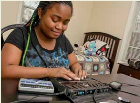
With substantial support from three local foundations, we purchased cutting-edge assistive technology, including interactive Smartboards , which help level the learning field for students with physical and developmental challenges.

Financials The Maryland School for the Blind is a private, 501(c)(3) school under Internal Revenue Service regulations. The School’s fiscal year ends June 30 th . Funding is provided primarily through grants from the Maryland State Department of Education and payments from local school districts. Contributions are received from individuals, corporations, foundations and community groups. Total expenses approximated $24.6 million.