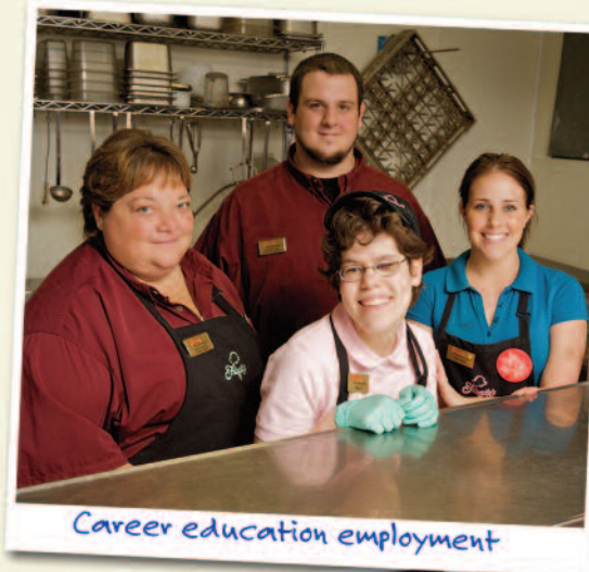
Career education employment