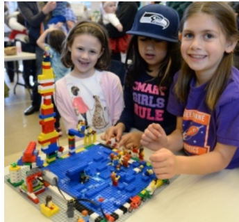
Figure 1 CHILDREN BUILDING WITH LEGOS