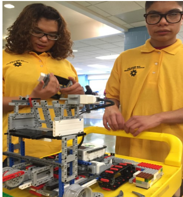
Figure 1 STUDENTS BUILDING WITH ROBOTICS

An Overnight Camp for Middle/High School students who are Blind or Visually Impaired.