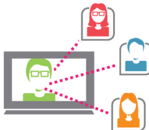
Figure 1 A person on a computer screen connecting with other people.

No need to leave the comfort of your home or office! Participate via your computer with Maryland School for the Blind Outreach as we explore transition in a monthly, informative, free webinar focusing on the transition process and resources available for your student with a visual impairment.