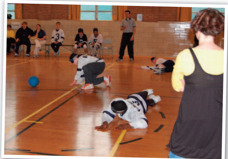
MSB students competing in goalball

If you would like to see our students compete or would like to support the sports programs at MSB, please visit our website to find the next meet or to make a donation.